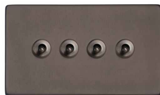
4 Gang Dolly X09.3430