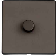
1 Gang Trailing Edge X09.260.TED