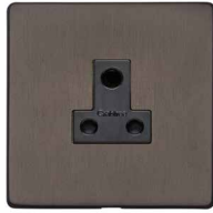
Round 3 Pin Unswitched Socket (5 AMP) X09.182.BK Box Depth: 35 mm