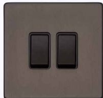
2 Gang Switch X09.110.BK