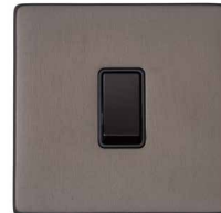
1 Gang Intermediate X09.101.BK