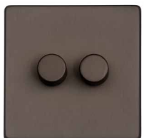
2 Gang Dimmer X09.270.250 (250 watts) X09.270.400 (400 watts)