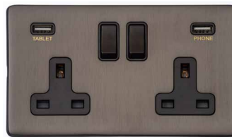
2 Gang Socket with USB Charger X09.750.BK-USB