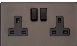
2 Gang Socket X09.150.BK