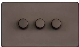
3 Gang Dimmer X09.280.250 (250 watts) X09.280.400 (400 watts)