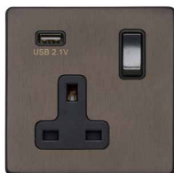
1 Gang Socket with USB Charger X09.740.BK-USB