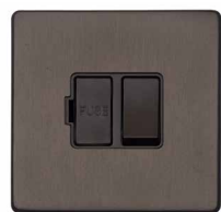
Switched Spur X09.135.BK