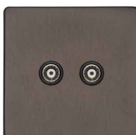
2 Gang TV Coaxial X09.122.BK TV/ FM Diplexed X09.224.BK