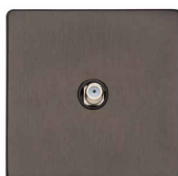
1 Gang Satellite X09.125.BK