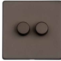
2 Gang Trailing Edge X09.270.TED