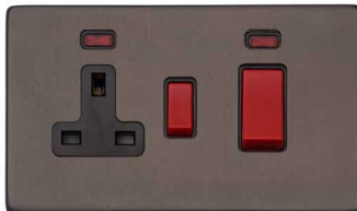
45 AMP Cooker Control X09.162.BK