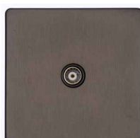
Non-isolated TV Coaxial X09.121.BK Isolated TV Coaxial X09.123.BK