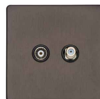
TV/ Satellite Socket X09.126.BK