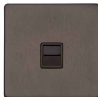
1 Gang Secondary Line X09.166.BK 1 Gang Master Line X09.167.BK