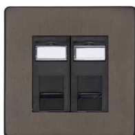
2 Gang Secondary Line X09.156.BK 2 Gang Master Line X09.157.BK