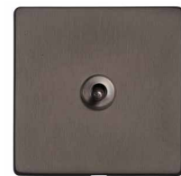
1 Gang Intermediate X09.3401