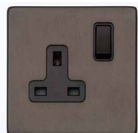
1 Gang Socket X09.140.BK