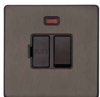
Switched with Neon X09.136.BK