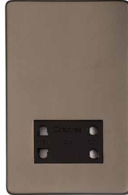
Shaver Socket Dual Output Voltage 110/ 240 V X09.185.BK Box Depth: 55 mm