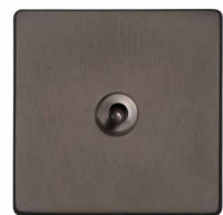
1 Gang Dolly X09.3400