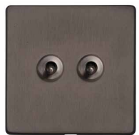
2 Gang Dolly X09.3410