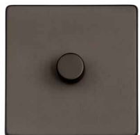
1 Gang Dimmer X09.260.250 (250 watts) X09.260.400 (400 watts)