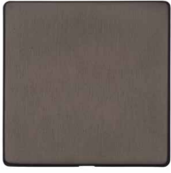
1 Gang Blank Plate X09.131