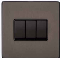
3 Gang Switch X09.120.BK