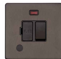
Switched with Neon/Cord X09.138.BK