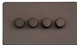
4 Gang Dimmer X09.290.250 (250 watts) X09.290.400 (400 watts)