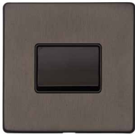
Triple Pole Fan Isolating Switch (6 AMP) X09.1990.BK Box Depth: 25 mm