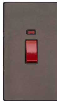
Double Cooker Switch X09.161.BK