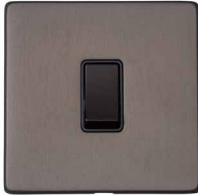
D.P. Switch X09.105.BK