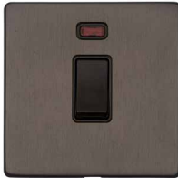
D.P. Switch with Neon X09.106.BK