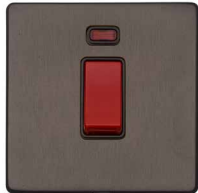
Single Cooker Switch X09.163.BK