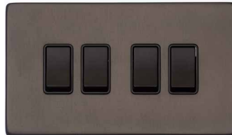
4 Gang Switch X09.130.BK (Box Depth 35 mm)