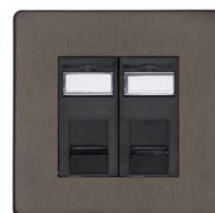
2 Gang RJ45 X09.158.BK