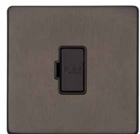
Unswitched Spur X09.134.BK