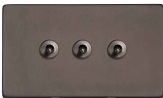
3 Gang Dolly X09.3420