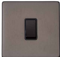
1 Gang Switch X09.100.BK