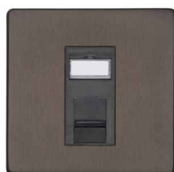
1 Gang RJ45 X09.168.BK 1 Gang RJ11 X09.169.BK