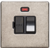
Switched with Neon XRN.136.BK