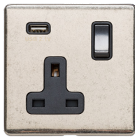
1 Gang Socket with USB Charger XRN.740.BK-USB