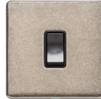
1 Gang Intermediate XRN.101.BK