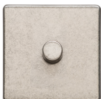
1 Gang Dimmer XRN.260.250 (250 watts) XRN.260.400 (400 watts)