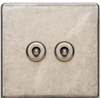
2 Gang Dolly XRN.3410