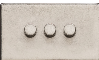
3 Gang Dimmer XRN.280.250 (250 watts) XRN.280.400 (400 watts)