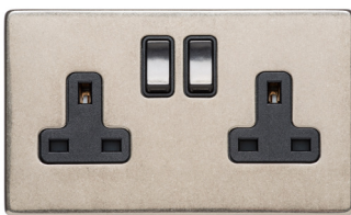
2 Gang Socket XRN.150.BK