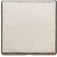
1 Gang Blank Plate XRN.131