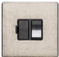
Switched Spur XRN.135.BK