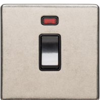
D.P. Switch with Neon XRN.106.BK