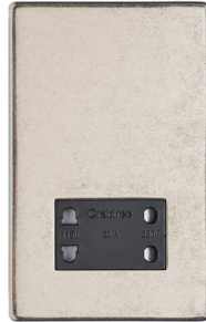
Shaver Socket Dual Output Voltage 110/ 240 V XRN.185.BK Box Depth: 55 mm