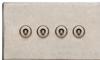
4 Gang Dolly XRN.3430