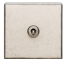
1 Gang Intermediate XRN.3401