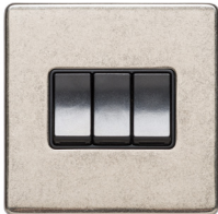
3 Gang Switch XRN.120.BK