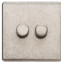
2 Gang Trailing Edge XRN.270.TED