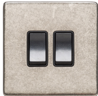
2 Gang Switch XRN.110.BK