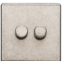
2 Gang Dimmer XRN.270.250 (250 watts) XRN.270.400 (400 watts)