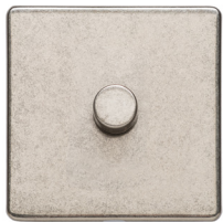
1 Gang Trailing Edge XRN.260.TED