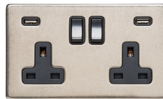
2 Gang Socket with USB Charger XRN.750.BK-USB