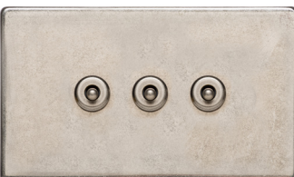
3 Gang Dolly XRN.3420