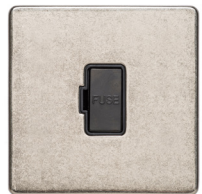
Unswitched Spur XRN.134.BK