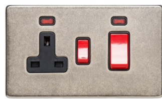
45 AMP Cooker Control XRN.162.BK