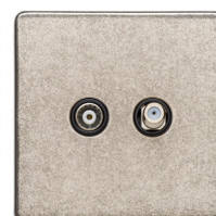
TV/ Satellite Socket XRN.126.BK