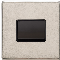
Triple Pole Fan Isolating Switch (6 AMP) XRN.1990.BK Box Depth: 25 mm