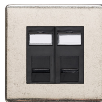
2 Gang RJ45 XRN.158.BK