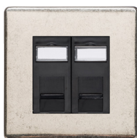
2 Gang Secondary Line XRN.156.BK 2 Gang Master Line XRN.157.BK