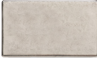
2 Gang Blank Plate XRN.132