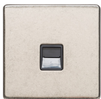
1 Gang Secondary Line XRN.166.BK 1 Gang Master Line XRN.167.BK