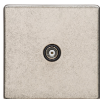
Non-isolated TV Coaxial XRN.121.BK Isolated TV Coaxial XRN.123.BK