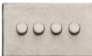
4 Gang Dimmer XRN.290.250 (250 watts) XRN.290.400 (400 watts)