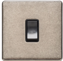
1 Gang Switch XRN.100.BK