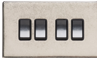
4 Gang Switch XRN.130.BK (Box Depth 35 mm)