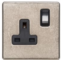
1 Gang Socket XRN.140.BK