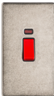
Double Cooker Switch XRN.161.BK