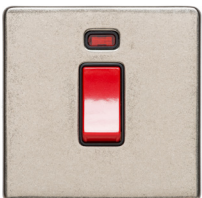
Single Cooker Switch XRN.163.BK