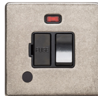
Switched with Neon/Cord XRN.138.BK