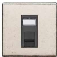
1 Gang RJ45 XRN.168.BK 1 Gang RJ11 XRN.169.BK