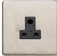
Round 3 Pin Unswitched Socket (5 AMP) XRN.182.BK Box Depth: 35 mm