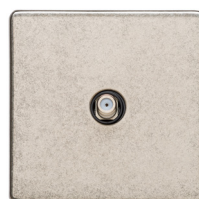
1 Gang Satellite XRN.125.BK