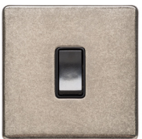
D.P. Switch XRN.105.BK