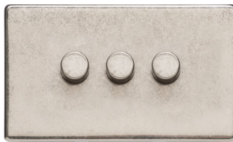
3 Gang Trailing Edge XRN.280.TED