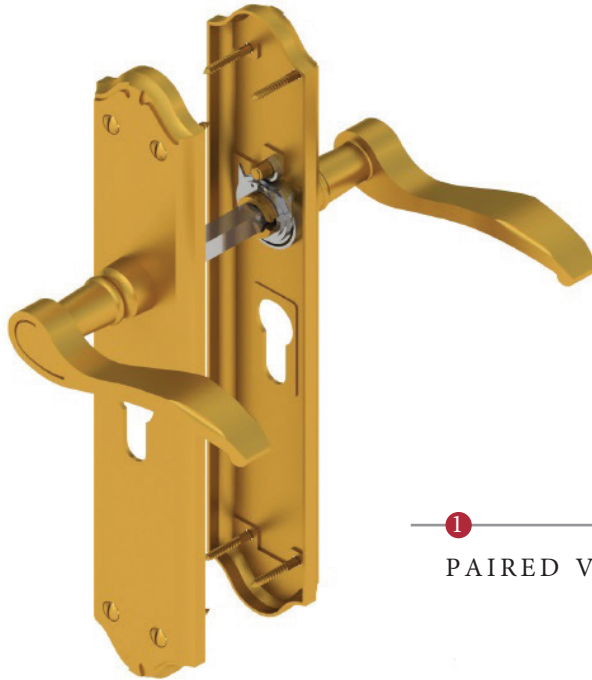
1 PAIRED VIEW